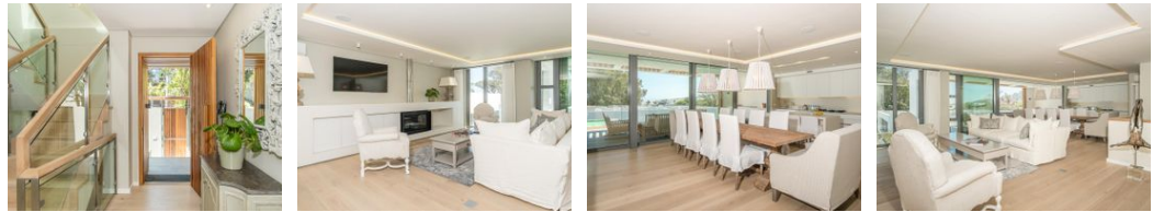
Web Ref RL1120