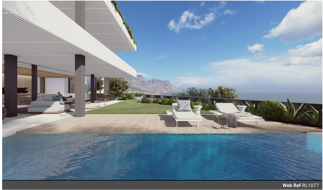
Web Ref RL1077

Shop 3 Central Parade Victoria Rd Camps Bay